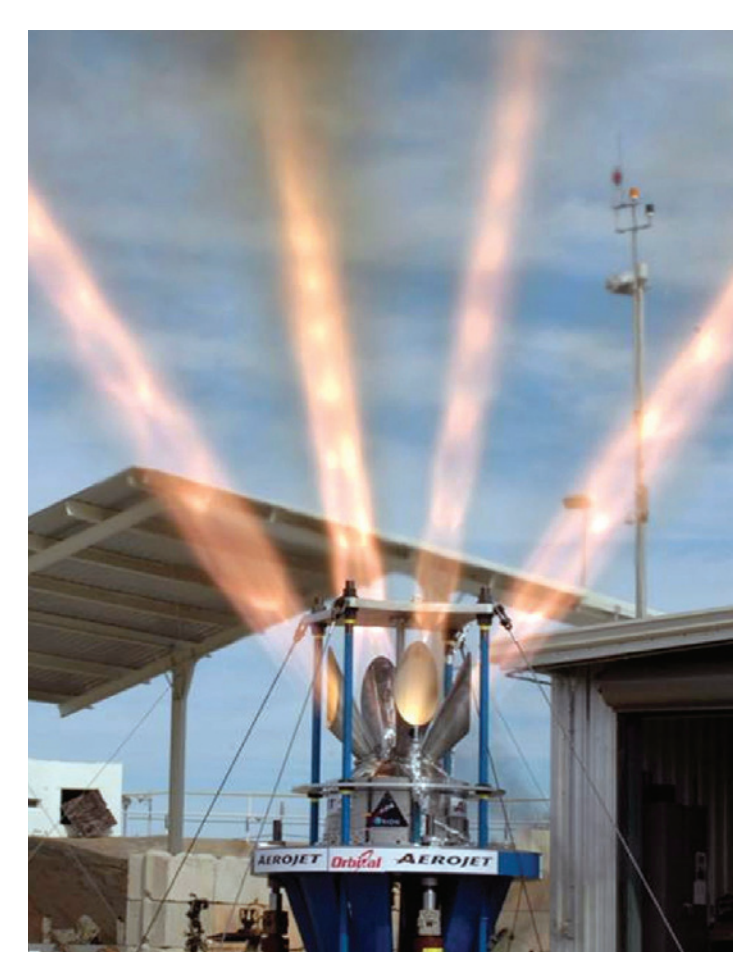
The successful test firing of the Orion jettison motor is the first full-scale rocket propulsion element qualified to proceed into a system-level demonstration.

Marshall's work on booster separation motors for the Space Launch System and the Launch Abort System for Orion illustrates the Center's ability to scale its solid propulsion capabilities to any spacecraft size or mission need. In addition, Marshall's expertise extends from initial design to manufacturing oversight, testing, and operational support.