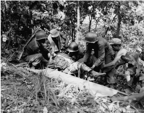
Fig. 4. Evacuation of a Korean War Casualty on a stretcher.