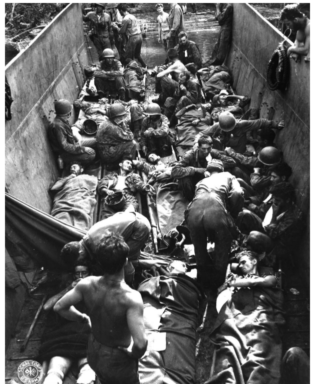
Fig. 3. Casualties lying on stretchers in the Southwest Pacific during World War II.

There was continued emphasis on characterization of the bacteria infecting wounds, and the impact of new antibiotics on outcomes and subsequent infections. An assessment of the bacteria in the wounds of 30 Marines at the time of injury and during the following 5 days was undertaken in Vietnam (Fig. 2). 63 The study evaluated wound cultures at the time of presentation, and again on days 3 and 5 after injury. Therapy included penicillin, typically combined with a second agent; most frequently streptomycin, followed by chloramphenicol and colistimethate. In addition to wound cultures, blood cultures were obtained every 8 hours daily or if temperature was greater than 38.5°C. Eighteen patients required amputation and 10 required laparotomies. The usual flora on day 1 was a mixture of gram-positive and gram-negative bacteria, which became predominantly gram-negative by day 5. Pseudomonas aeruginosa became the most commonly recovered bacteria by day 5. Eight of 12 patients had bacteria recovered in their blood that matched their wound cultures. All bacteria recovered in blood were resistant to penicillin and streptomycin. This article is often cited supporting Acinetobacter as the most common pathogen recovered in wounds from Viet-