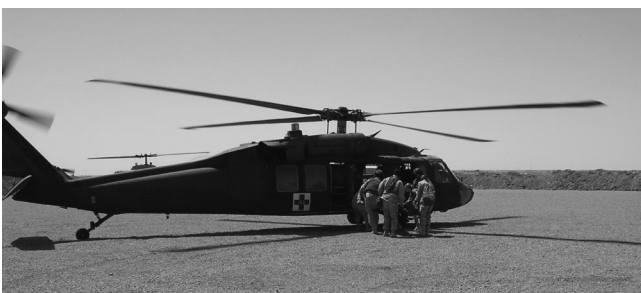
Fig. 6. Evacuation of casualties during Operation Iraqi Freedom.

nam. The data in this study and others do not support this proposal, and Tong, 64 the author of the original work, does not recall if the taxonomy would be equivalent to Acinetobacter today. Noyes found similar changes in bacteria during