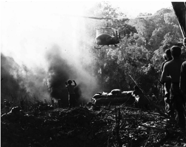
Fig. 5. Helicopter landing during Vietnam War.