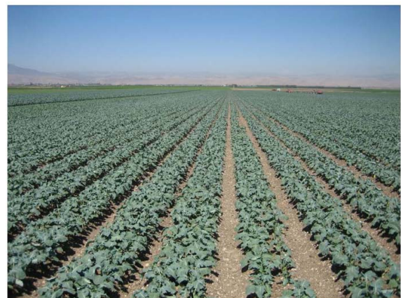
Fig. 2. Organic broccoli production as a monoculture in the Salinas Valley, California. Unlike a diversified farming system (whether certified as organic or not), this organic production system is more like conventional industrialized agriculture, utilizing substantial off-farm inputs such as purchased compost and other soil amendments, “organic” pesticides, etc.

DFS is similar to another concept, ecoagriculture, in recognizing that landscapes, not single farms, are important targets of land management. Other concepts, such as climate-smart agricultural landscapes or integrated watershed management, also make this link ( http://blog.ecoagriculture.org/2012/03/05/terminology/ , accessed Mar 13 2012), each with their own particular emphasis. DFS emphasizes how farming practices operating from plot to landscape scales maintain functional biodiversity and thus ecosystem services. Ecoagriculture emphasizes “landscapes in which biodiversity conservation is an explicit objective of agriculture” (Scherr and McNeely 2008:477). The DFS concept highlights the critical reciprocity underlying the ecoagriculture concept, that is, that the ecoagricultural landscape promotes biodiversity and in turn, critical components of biodiversity (i.e., functional biodiversity) promote agriculture through provision of ecosystem services. In summary, DFS, while closely allied to all of these concepts, places more emphasis upon the relationship between functional biodiversity and ecosystem services.