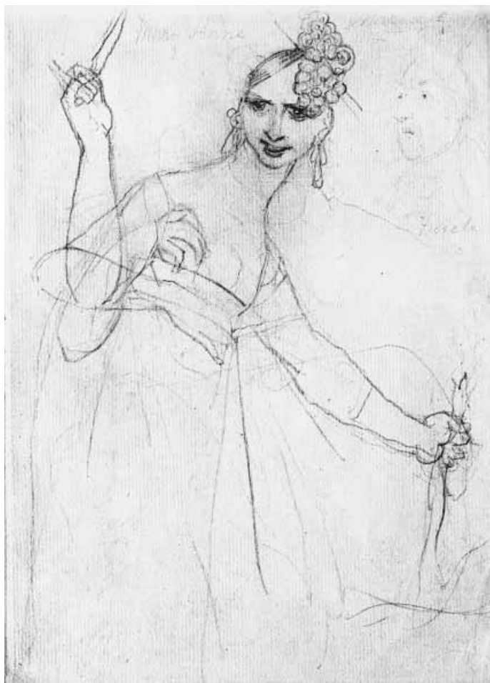
Figure 2 Henry Fuseli, “Woman with a Stiletto, Man’s Head with a Startled Expression” (1810–1820). This drawing bears three inscriptions by an unknown contemporary hand, two along the upper edge: “Mary Anne” and “Maria[illegible] 179[?]”; the third, “Fuseli,” can be seen beneath the man’s head. The word after “Maria” appears either smudged or erased; the “179” is a date, though the final digit has been cut off by the edge of the paper. These inscriptions and the incomplete date (possibly 1796, the year in which Lamb murdered her mother) are generally thought to refer to Mary Anne Lamb.