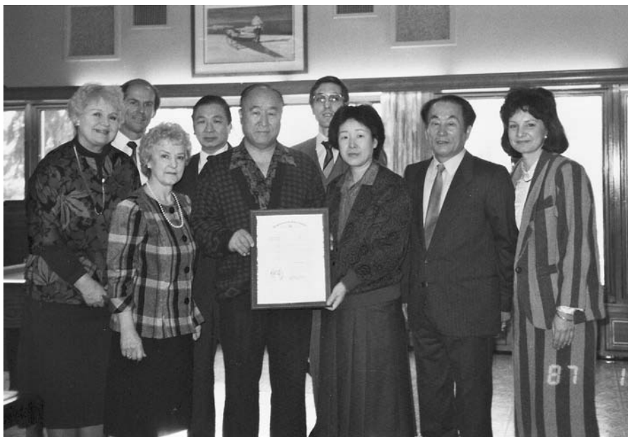
Barrytown, New York, 1987. Reverend and Mrs. Moon (center), founders of the Unification Theological Seminary are holding a certificate of accreditation from the Commission on Higher Education of the Middle States Association of Colleges and Schools.