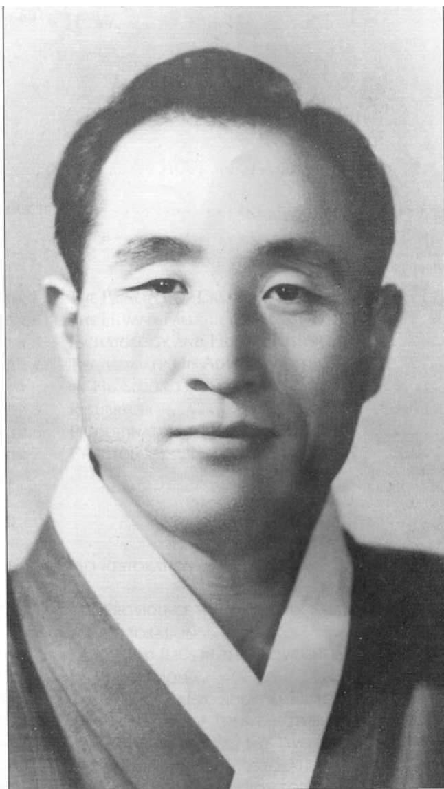
Sun Myung Moon