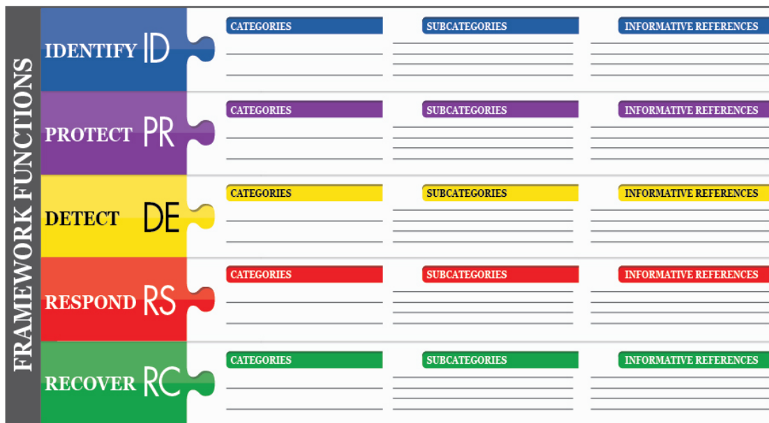
Figure 1: Framework Core Structure

The Framework Core provides a set of activities to achieve specific cybersecurity outcomes, and references examples of guidance to achieve those outcomes. The Core is not a checklist of actions to perform. It presents key cybersecurity outcomes identified by industry as helpful in managing cybersecurity risk. The Core comprises four elements: Functions, Categories, Subcategories, and Informative References, depicted in Figure 1 :